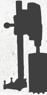
CONCRETE CORE DRILLING