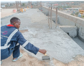
Flat roof waterproofing

C oncrete is a porous compound which absorbs water, waterborne contaminants and chemicals that causes it to deteriorate. Modern technologies in waterproofing is key to enhancing the sustainability of your infrastructural developments. In this process, we apply a waterproof membrane on concrete which makes the structure water tight so that it remains relatively unaffected by water leakages.