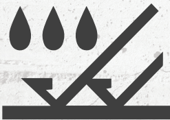
WASTE WATER RECYCLING