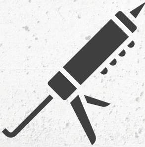
JOINT SEALANTS GROUTS & ANCHORS