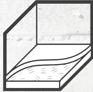
CONCRETE SLABS & FLOORS